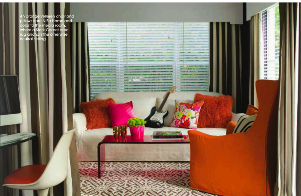
An orange Velleren chair and pillows from NiBa Home add color to the media room, where a Stark Carpet area rug anchors the otherwise neutral setting.

with design has come a long way since her New York beginnings. She now serves as the Miami city editor for Metropolitan Home magazine and as a member of the advisory board of the Miami-Dade County public school, Design and Architecture Senior High.