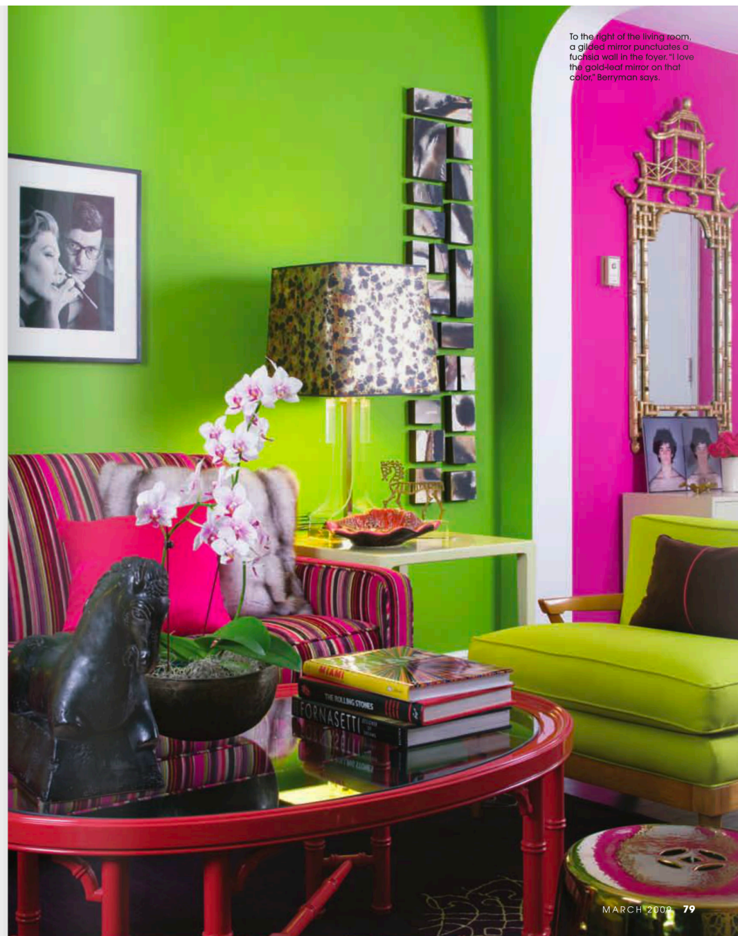
To the right of the living room, a gilded mirror punctuates a fuchsia wall in the foyer. "I love the gold-leaf mirror on that color," Berryman says.